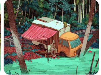
Angel Stanich 2